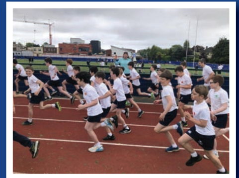
Sports Day with Construction behind