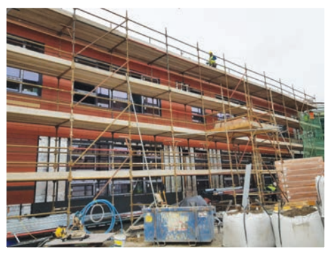
STEM Block scaffolding and outer shell – March 2023