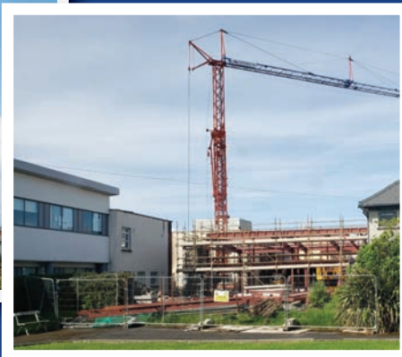
Multi-Purpose Building – May 2023