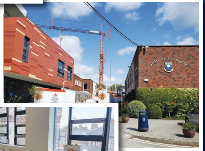
Junior School building works