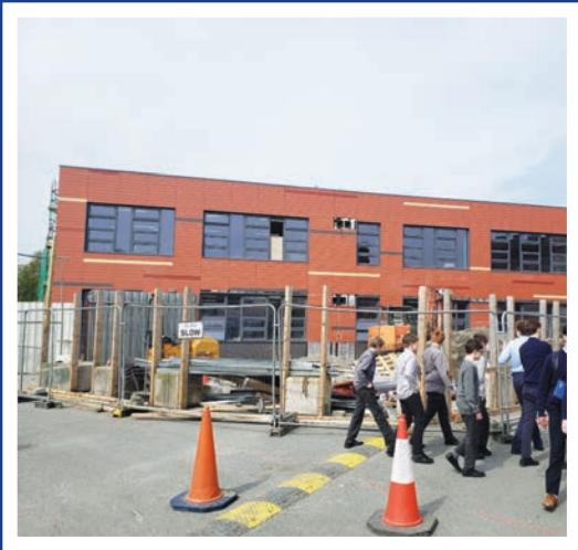
STEM Block May 2023