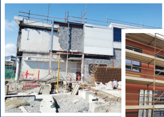
STEM Block ground prep works – Sept 2022