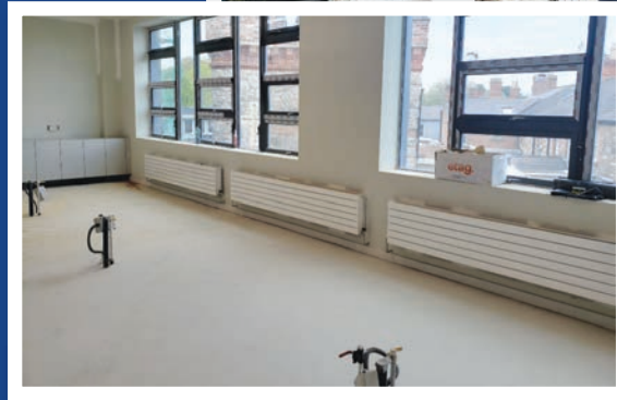
Science Lab Interior – May 2023