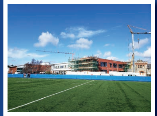
Campus Construction – April 2023